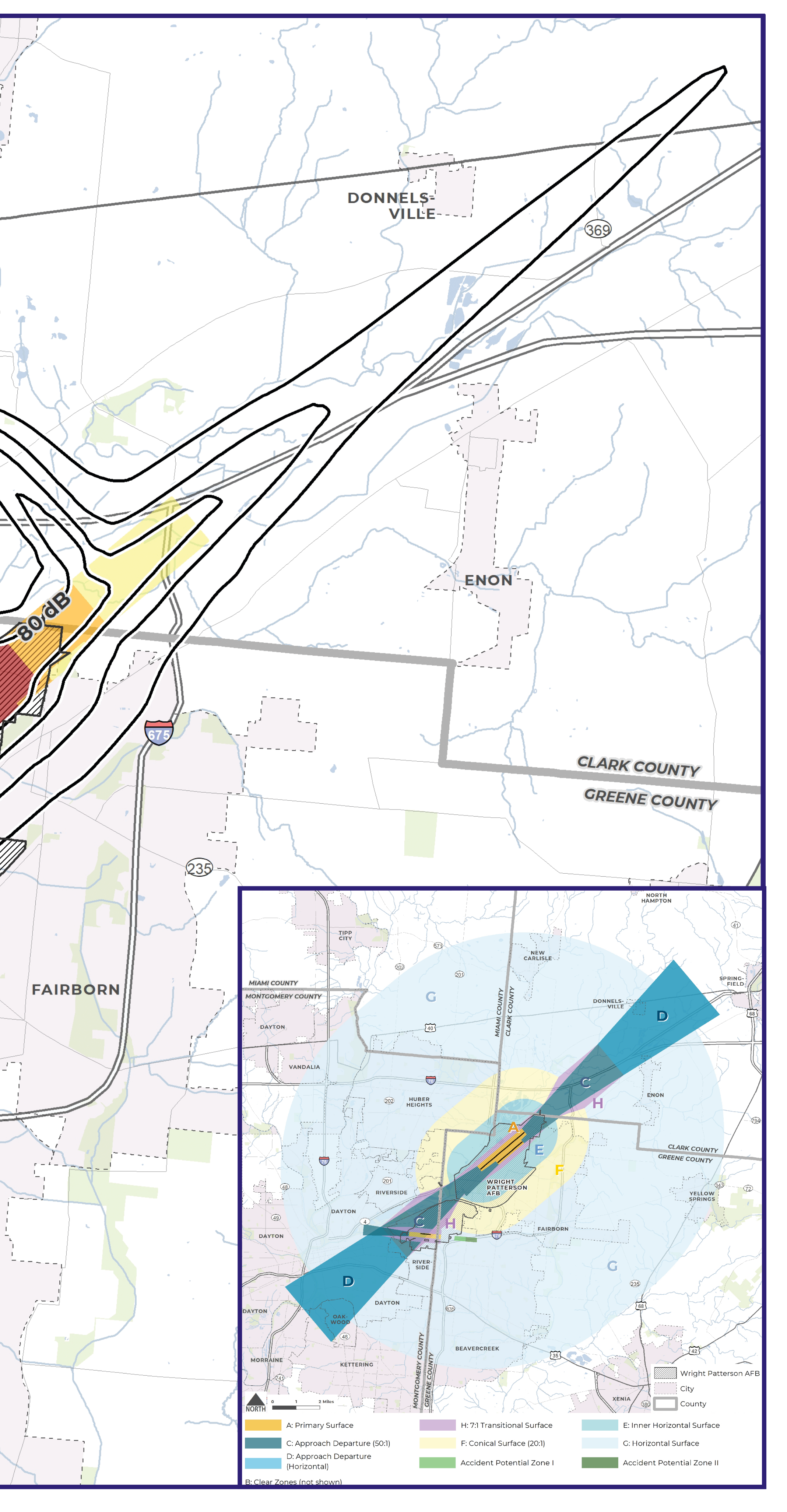
Wright Patterson AFB County